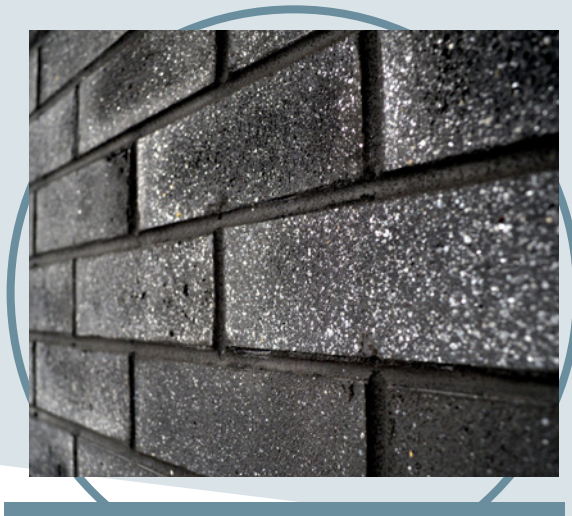
An example of black sparkle bricks on a QuietStone fire board

Just imagine what you could create if traditional brick colours were not a limitation! Think about colour, texture and finish – all key components in the creation of something new. Our bespoke service helps you realise that dream and make it a reality.