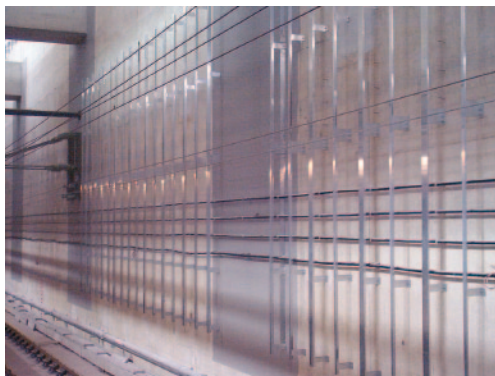
A simple aluminium frame is fixed to the wall.

The panels were installed on a simple aluminium framework, the type typically used for facade mounting. This framework was fast to install and the panels were attached using Tek, self-drilling screws. This leads to rapid installation as there are no need to pre-drill holes and once the panels are up, mechanical fixings are 'plugged' with the same material to hide the holes. Smaller panels were also installed to hide fixings to the side.