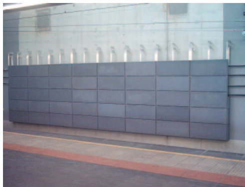
Panels are attached to the frame with Tek, self-drilling screws.