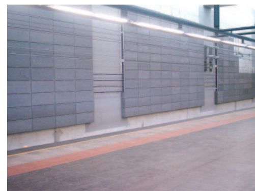
Smaller panels installed at the sides to hide fixings. Plugs of the same material hide the screw holes.

Telephone number +44(0) 1260 253 253 email address info@quietstone.co.uk Website address www.quietstone.co.uk Company registration number 07592216