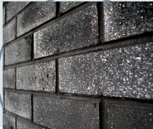
An example of black sparkle bricks on a QuietStone fire board

Just imagine what you could create if traditional brick colours were not a limitation! Think about colour, texture and finish – all key components in the creation of something new. Our bespoke service helps you realise that dream and make it a reality.