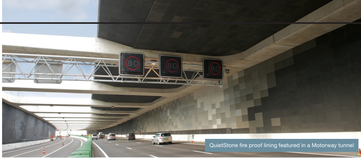
QuietStone fire proof lining featured in a Motorway tunnel