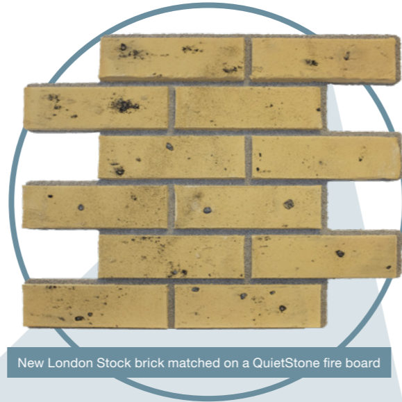
New London Stock brick matched on a QuietStone fire board

Whatever the reason, our skilled craftsmen are on hand to help. Provide us with a sample, and we will do our best to match the brick for you, then apply it to QuietStone fire boards, ready for you to install.