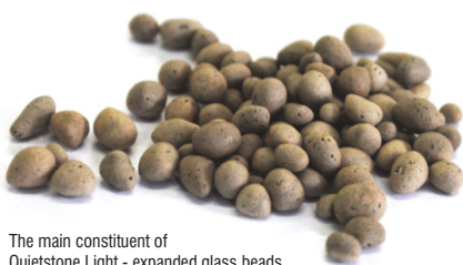
The main constituent of Quietstone Light - expanded glass beads